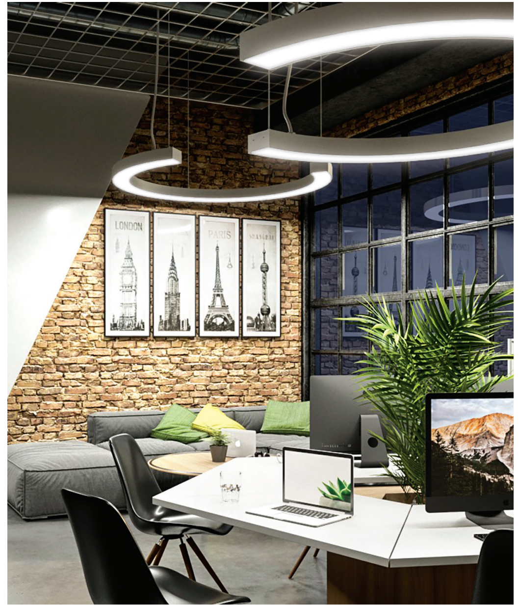
Thinline C Suspended Direct | Architectural Series