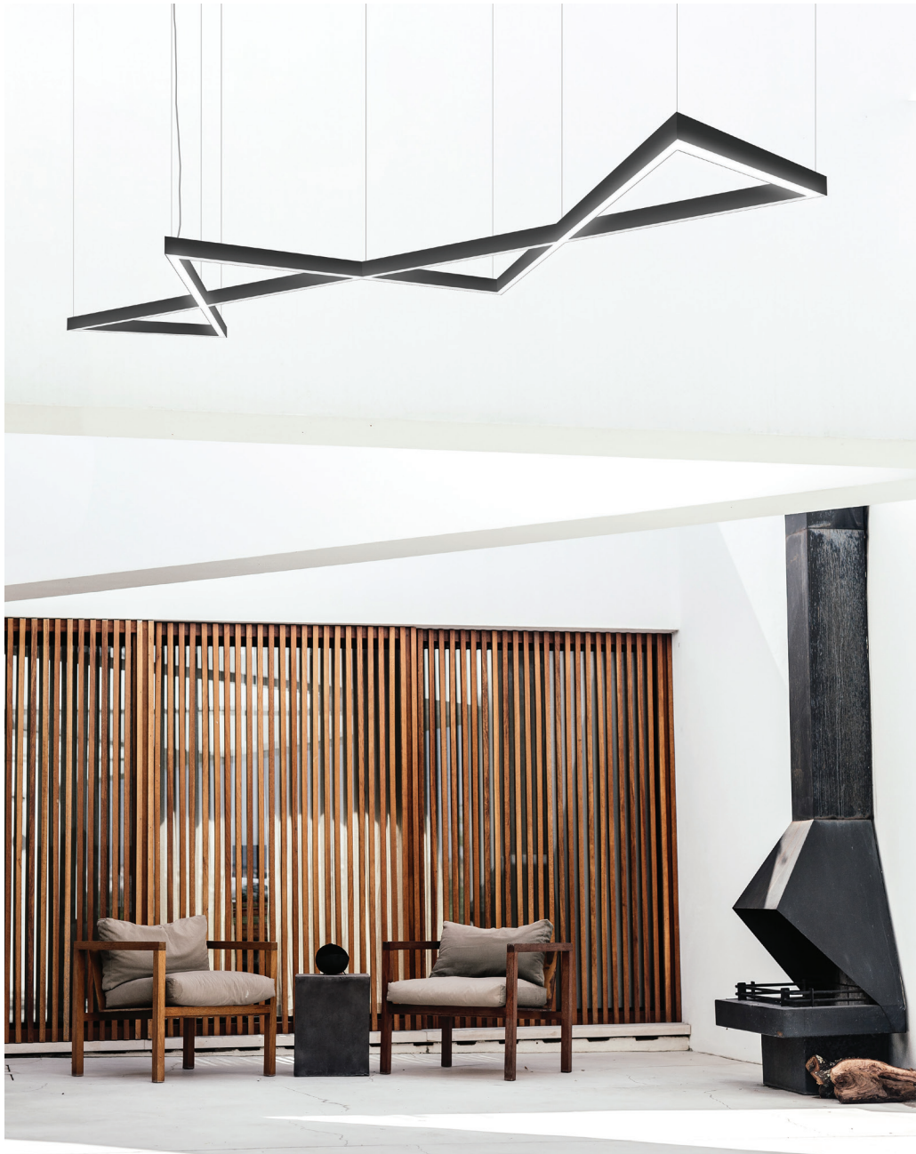
DTL Triangle Combinations Suspended Direct / Indirect | Architectural Shapes