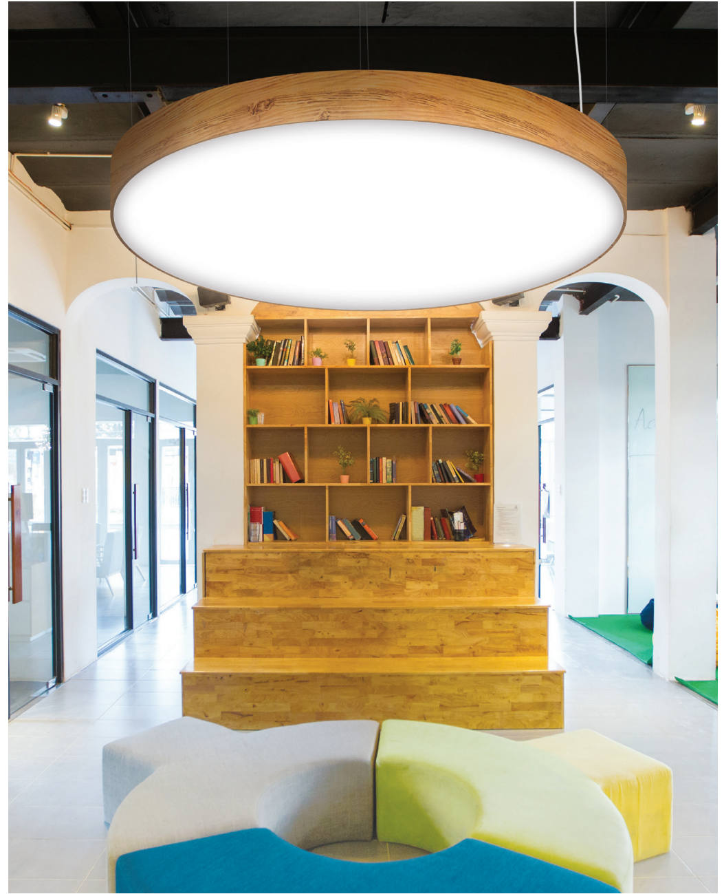
Zip Cloud Suspended Direct | Designer Vinyl Series