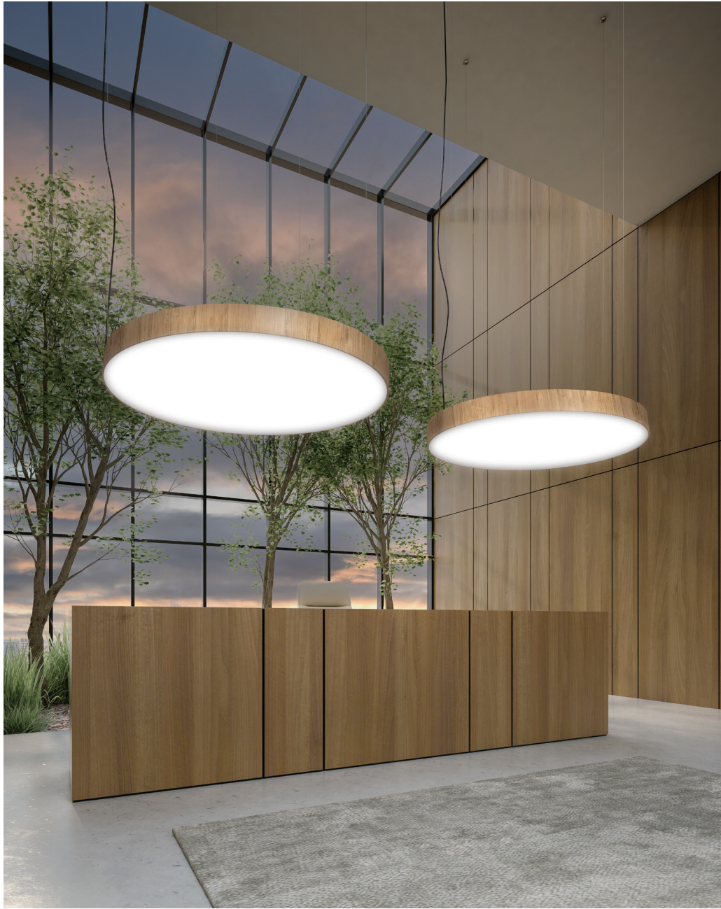
Zip Cloud Suspended Direct / Indirect | Designer Vinyl Series