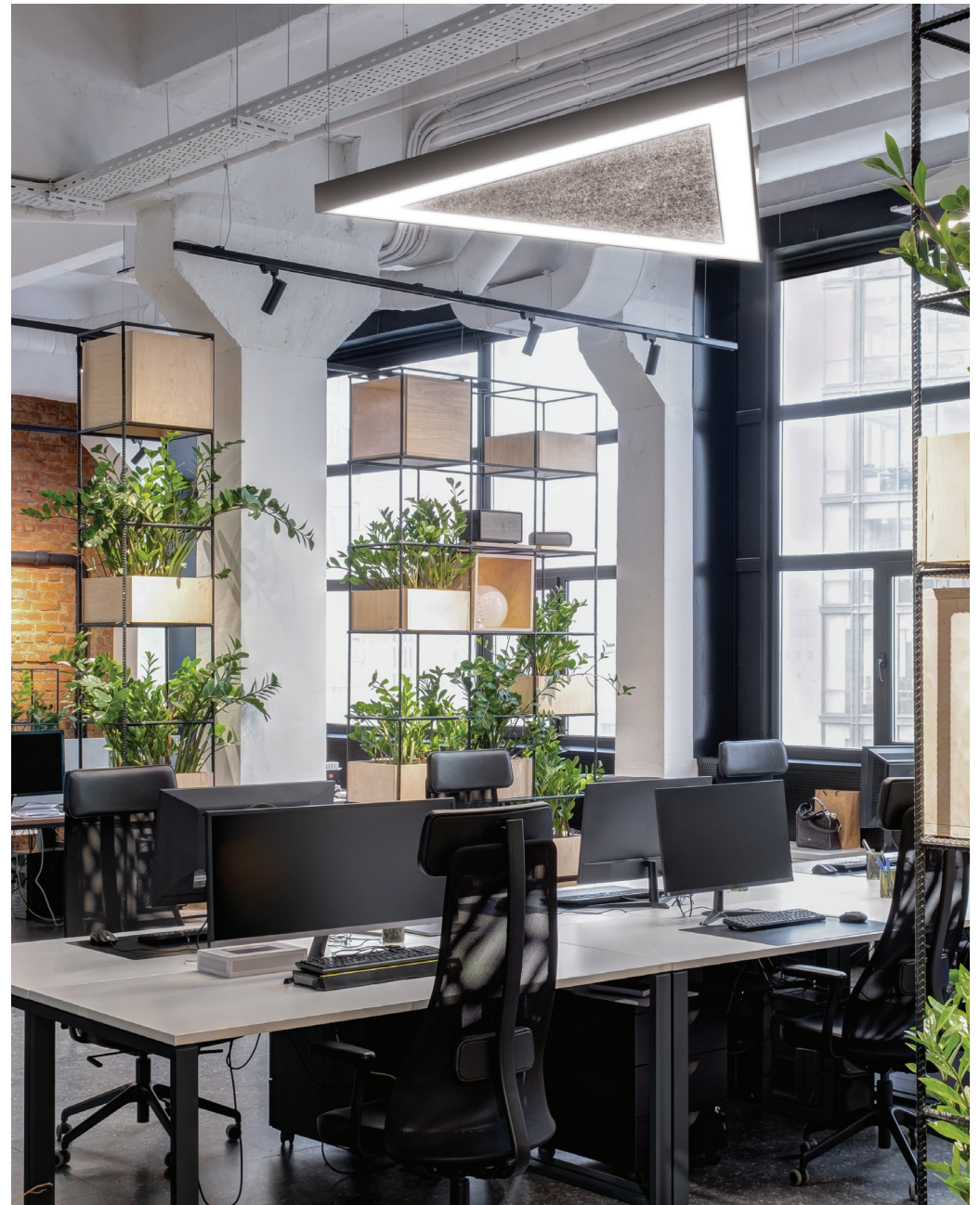
DTL Triangle Suspended Direct | Acoustic Lighting